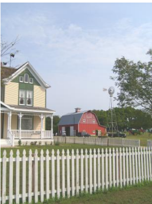
Three Sisters Park - Homestead

The purpose of our club is to preserve the tradition of antique tractors and farm equipment through our annual Three Sisters Farm Heritage Days Antique Tractor & Equipment Show, club activities, and other area events. Our members own many brands of tractors and equipment. We also have many members who do not own an antique tractor but still enjoy participating in the club activities. While Three Sisters Park, Chillicothe, IL is home to our show, members come from several surrounding counties. Our activities are focused on reaching out to others and educating them on the legacy of antique farm equipment.